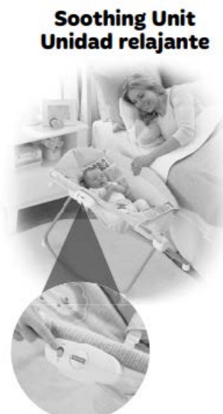
Above: Figure 11

130. This image is misleading because it implies that mothers can sleep when their babies are in the sleepers, while, at the same time, Defendants warn that babies should be supervised when in a Rock 'n Play Sleeper. Mothers cannot supervise their children when they are themselves sleeping.