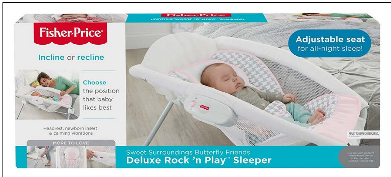
Above: Figure 8

97. The marketing statements on the packaging conflict with the AAP’s guidelines and recommendations, and those of other infant sleep experts.